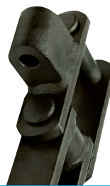
Shuttle Car Conveyor Chains